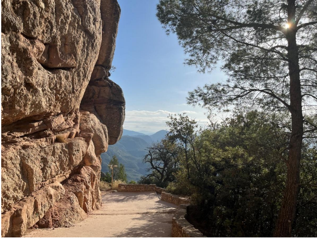
The path by the cave at Montserrat where the statue of the Black Madonna was found